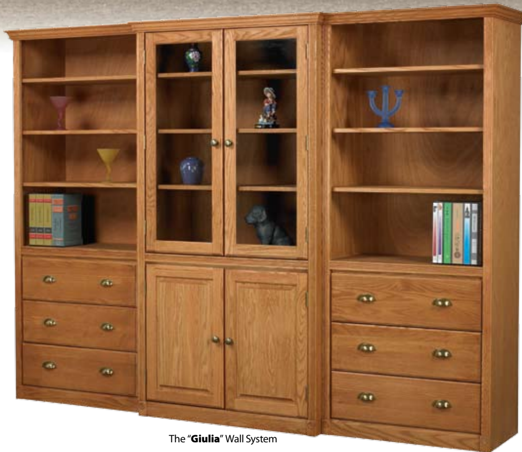
The "Giulia" Wall System

■ Cup Pulls per Drawer: 24" wide: 1 pull 30" & 36" wide: 2 pulls